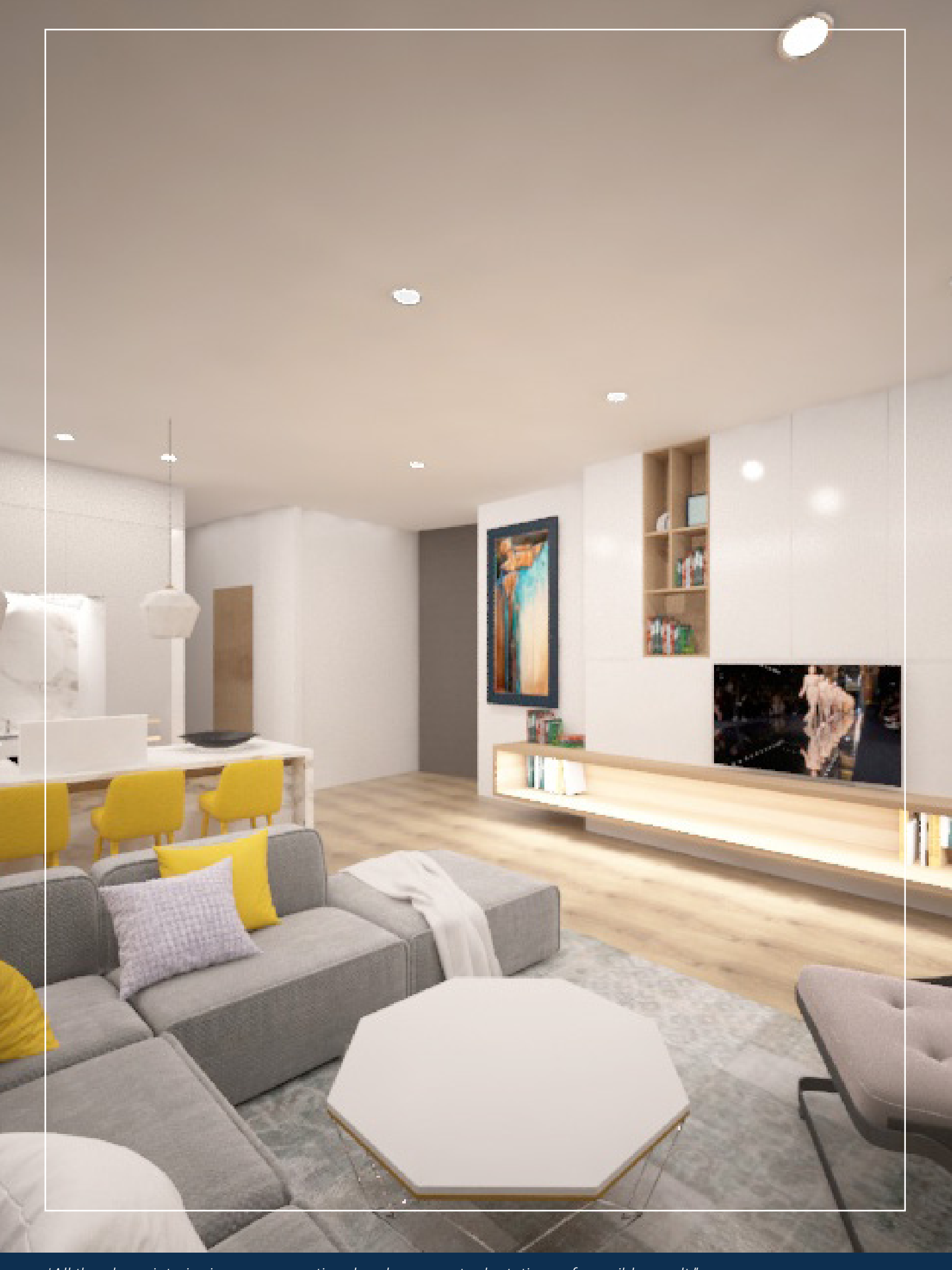
*All the above interior images are optional and represent adaptations of possible result."